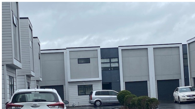
Pragma Homes, Hamilton