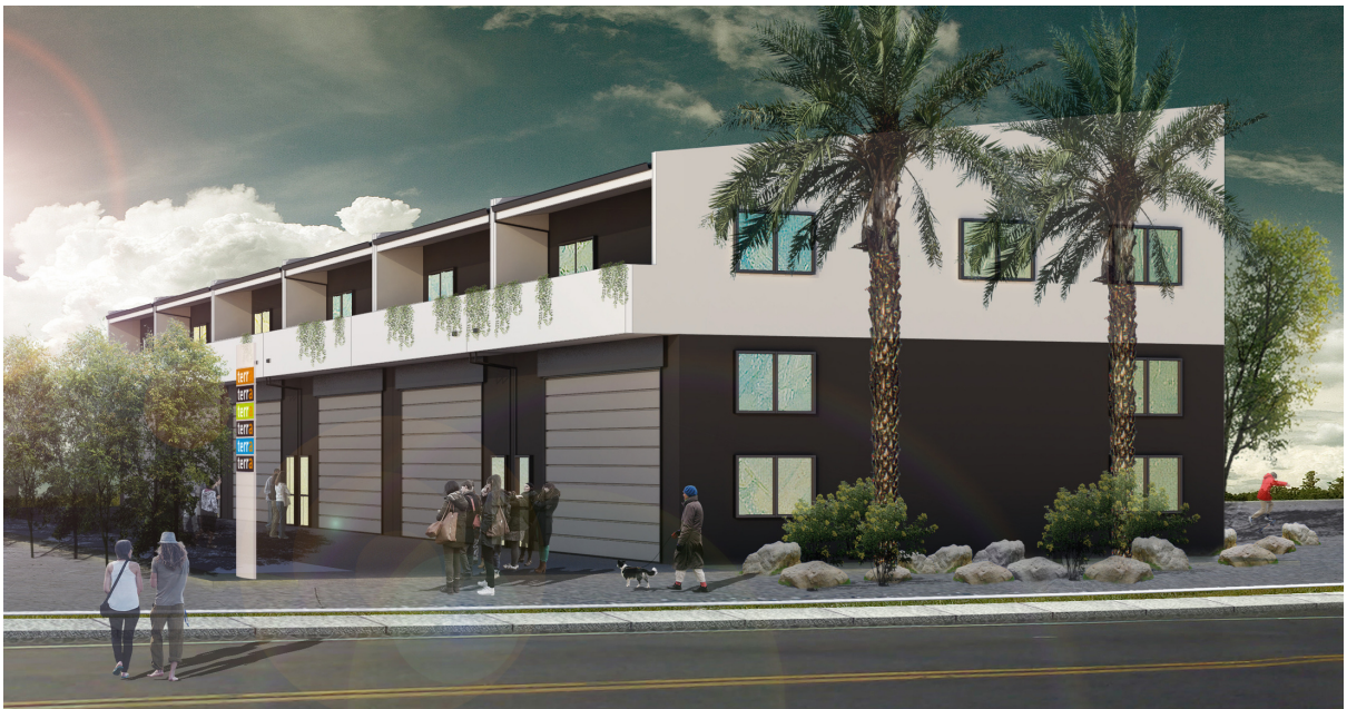
6 x mixed-use residential/commercial units, Rabone Estates Development, Henderson

OUR UNIQUE PROCESS DELIVERS SPEED, STRENGTH, COST EFFECTIVENESS, DURABILITY, AESTHETICALLY PLEASING