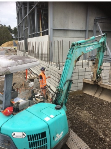
KUMEU FILM STUDIOS ($18m), Head Site Manager & Main Contractor, 2017 - 2019