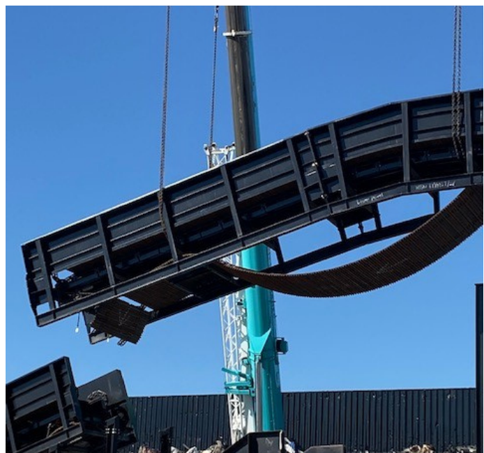
Auckland Scrap Yard (Main Contractor (Civil) & Construction of a 14000m2 concrete pad)