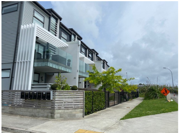
Hobsonville Point Development, 60 x in-situ units, HOBSONVILLE POINT & MILLWATER developments, 2015 - 2016 (concrete pad, walls & mid floors. Doka form system)