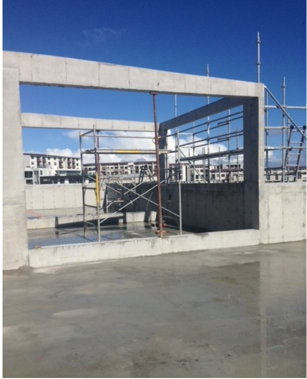
20 Norwich Avenue